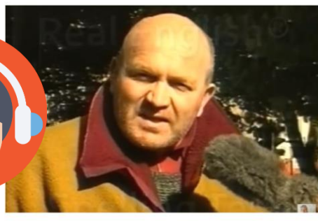
Real English® All rights reserved.